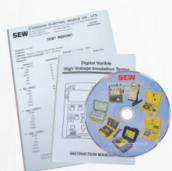
Test report Instruction manual CD