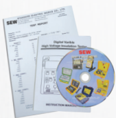
Test report Instruction manual CD