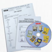
Test report Instruction manual CD