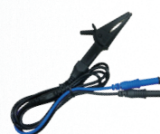
AL-33B Special Resistance Test Lead